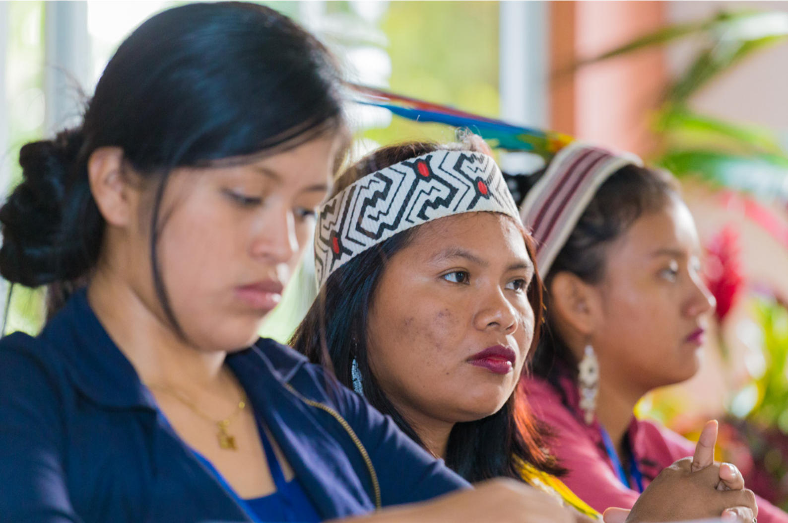
Leadership Program with Gender Sensitivity for Young Indigenous People

so is usually sexual. That is why most of the abuses inflicted on women are sex crimes, although the root of the problem is structural: