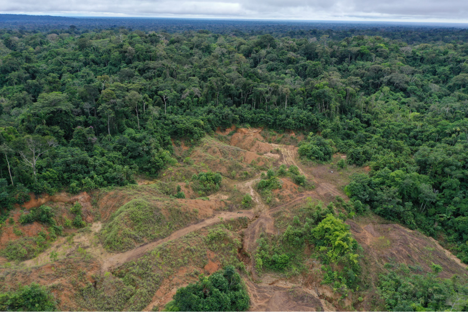
Communal Reserve AmaraKaeri