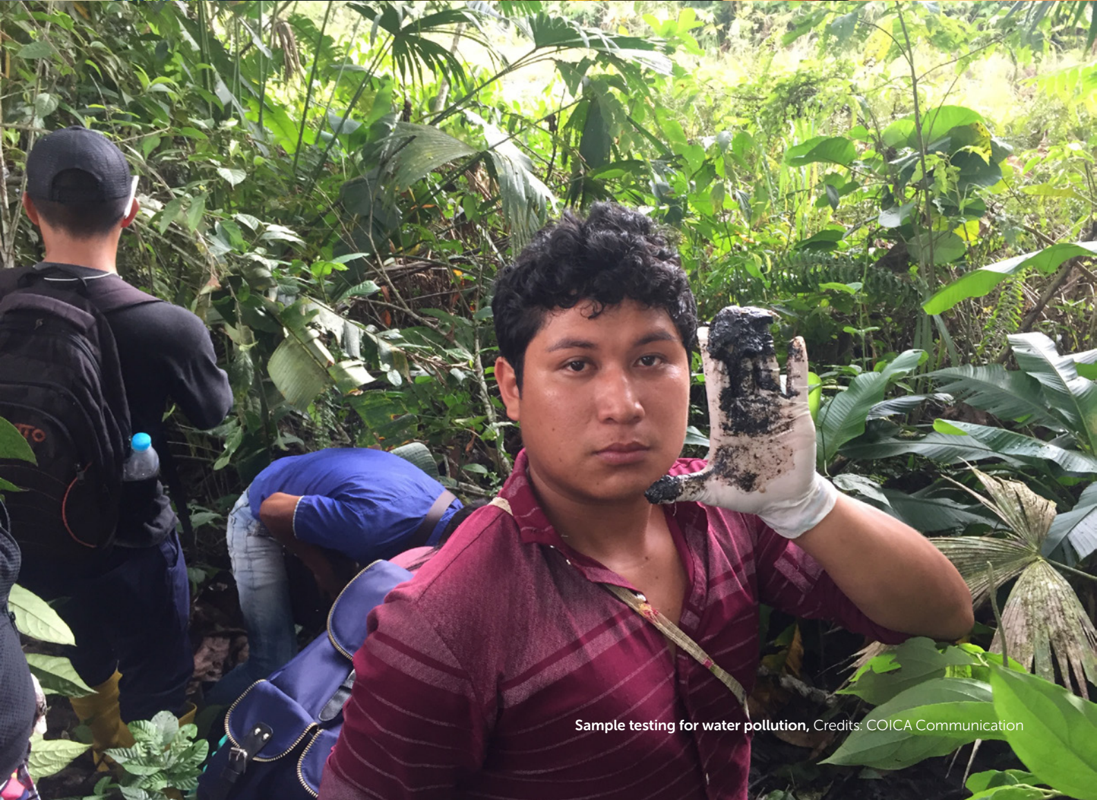
Sample testing for water pollution