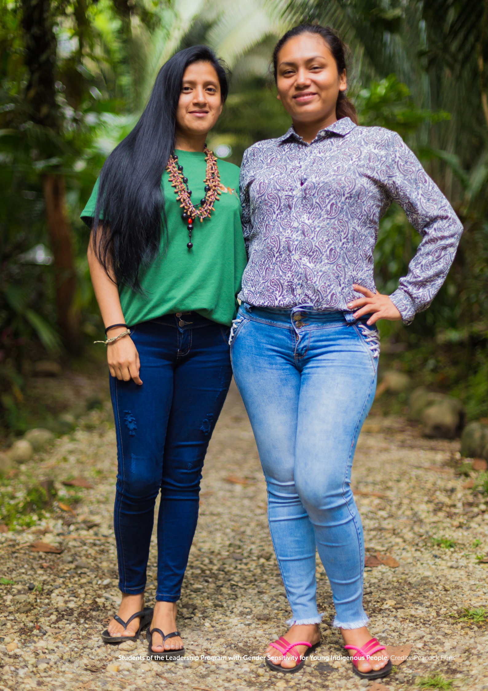
Students of the Leadership Program with Gender Sensitivity for Young Indigenous People