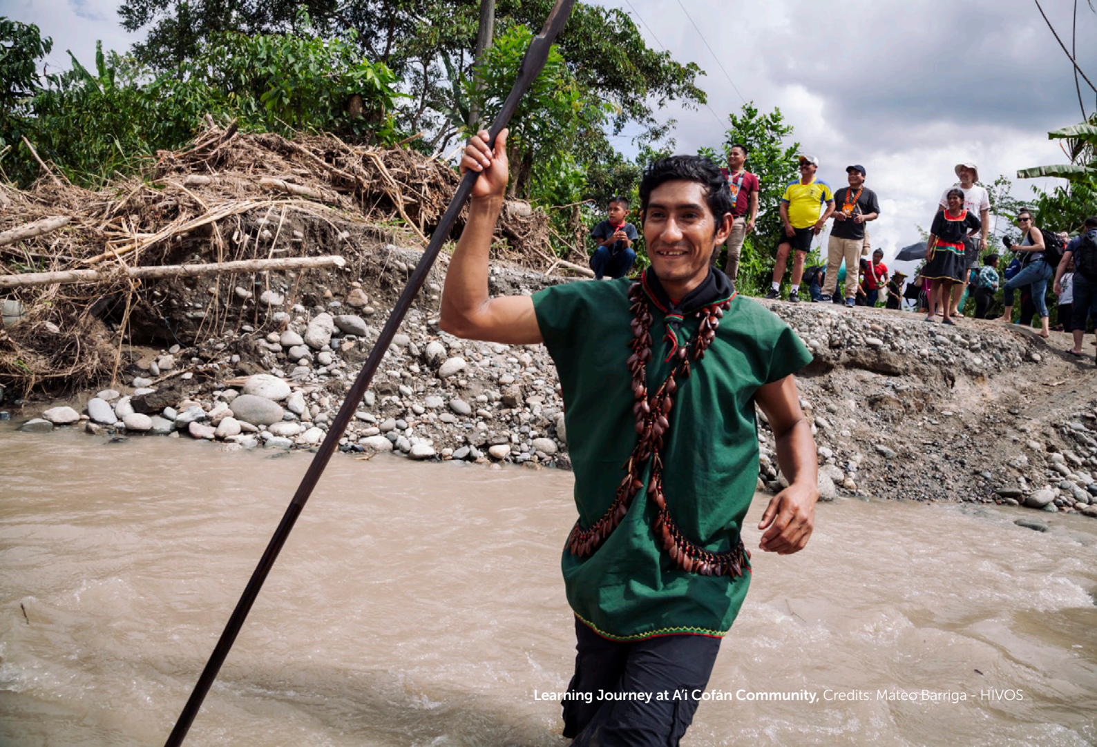
Learning Journey at A'i Cofán Community

In other words, the past and the present are part of one continuity. Ancient history and the knowledge of a community have no relevance without their current expression. The light of the present isn't perceptible without its shadow projected over the past. Past voices dialogue with the present ones, and nourish them. History has shown that it repeats itself; that we are not on a straight road to a brighter future; that humanity makes the same mistakes over and over again, and that perhaps many of the keys to happiness for humankind reside in the convergence of past and future.